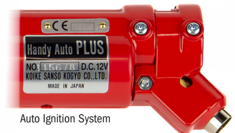
Auto Ignition System

Integrated Precision Valves govern the pilot gas, cutting gas, preheat oxygen, and cutting oxygen, ensuring precise control of the cutting process. The system incorporates a high-frequency current generator , which activates when you squeeze the ignition lever, streamlining the operation for optimal efficiency. "Pull to set" safety knobs prevent accidental changes once adjusted.